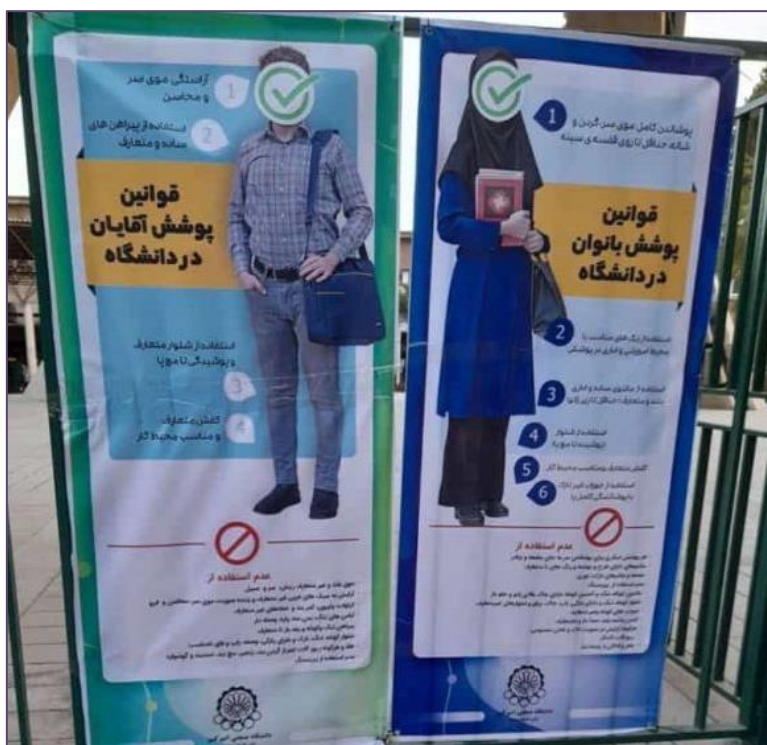
Banner indicating clothing regulations at Tehran's Amir Kabir University

Although the legislation is not yet approved by the Guardian Council to be enforced as a law, but reports revealed strict dress codes enforced by female agents at universities, involving head coverings and knee-long attire. Universities implemented regulations using banners, patrols, and even facial recognition technology.