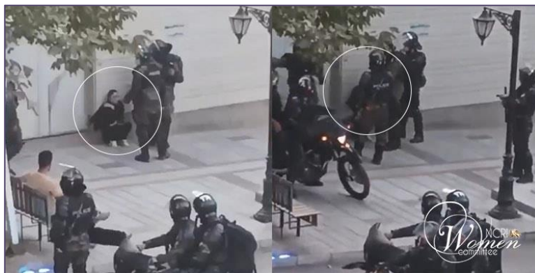
A lone young woman surrounded by security forces in Hamedan

On September 16, 2023, IRGC mercenaries violently attacked women detainees at Qarchak Prison, resulting in at least 20 wounded inmates. Many suffered beatings, were relocated to solitary confinement, and deprived of necessities like boiling water, food, and medicine. The next day, clashes erupted between women, youths, and security forces in Hamedan, marked by chants “death to Khamenei” and “death to the Republic of Executions.” In a shocking scene, security forces surrounded a lone woman for arrest in District 13 of Hamedan.