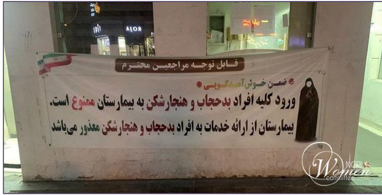
Hospital does not allow women without Hijab