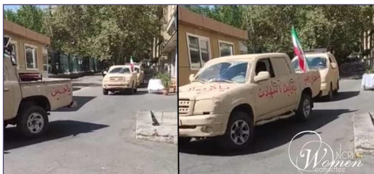
Camouflaged cars roaming on Tehran University's Campus

Coffee shops around campuses were ordered closed, with concerns cited about these spaces being potential centers for activities against national security and religion. These actions reflected the regime's anxiety about potential protests.