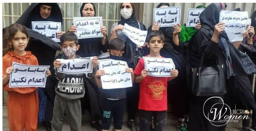
Families rally outside the Judiciary HQ in Tehran

On various instances, these families and their young children gathered outside the mullahs' Judiciary in Tehran and in front of other prisons in Isfahan, Bandar Abbas, Karaj , etc. urging the authorities not to execute their loved ones. They vehemently protested the rising number of executions and demanded an immediate halt to the unjust execution orders imposed on their loved ones.