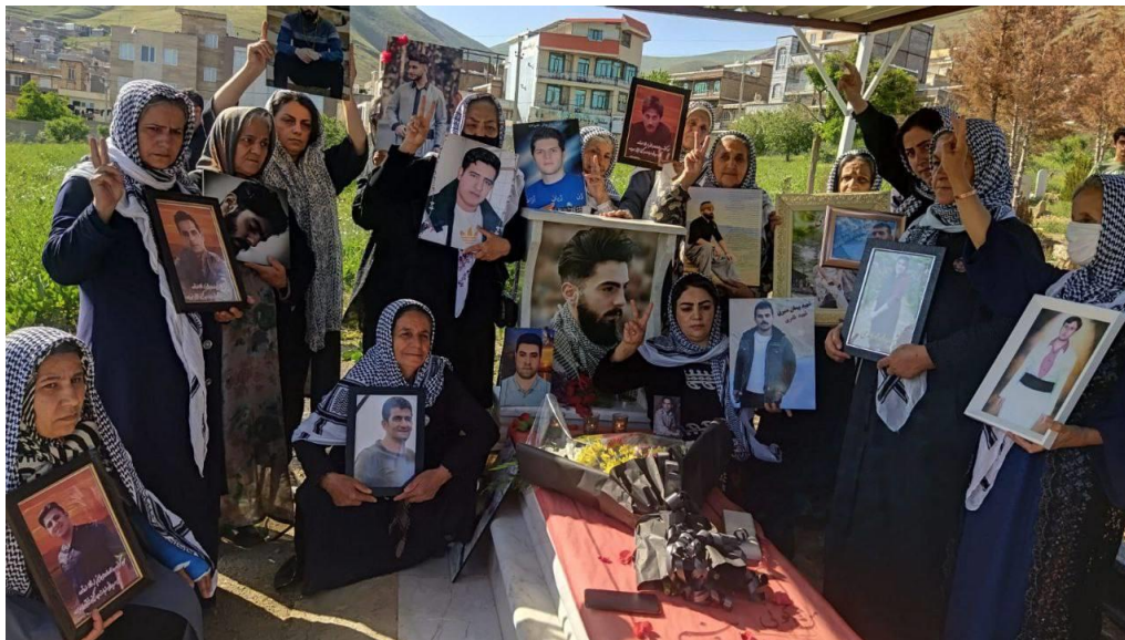
Mothers of Kurds killed by security forces during Iran protests