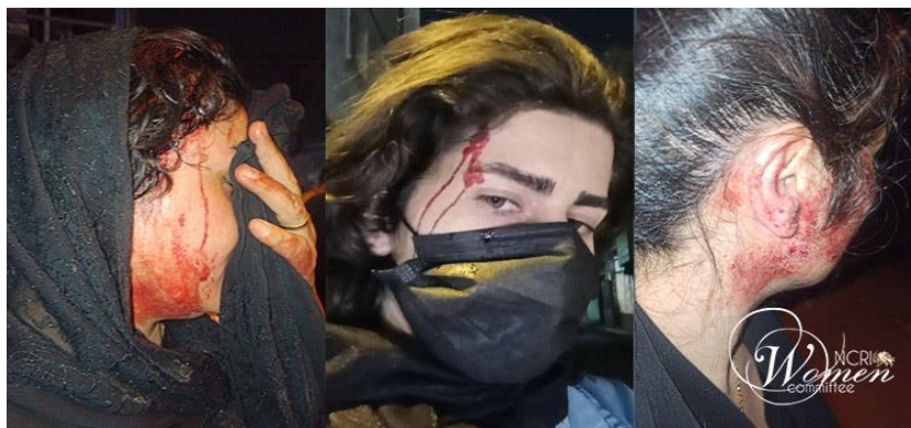
Families of death-row prisoners wounded in raid by SSF

Of course, the State Security Force dealt with them brutally and fired tear gas at them.