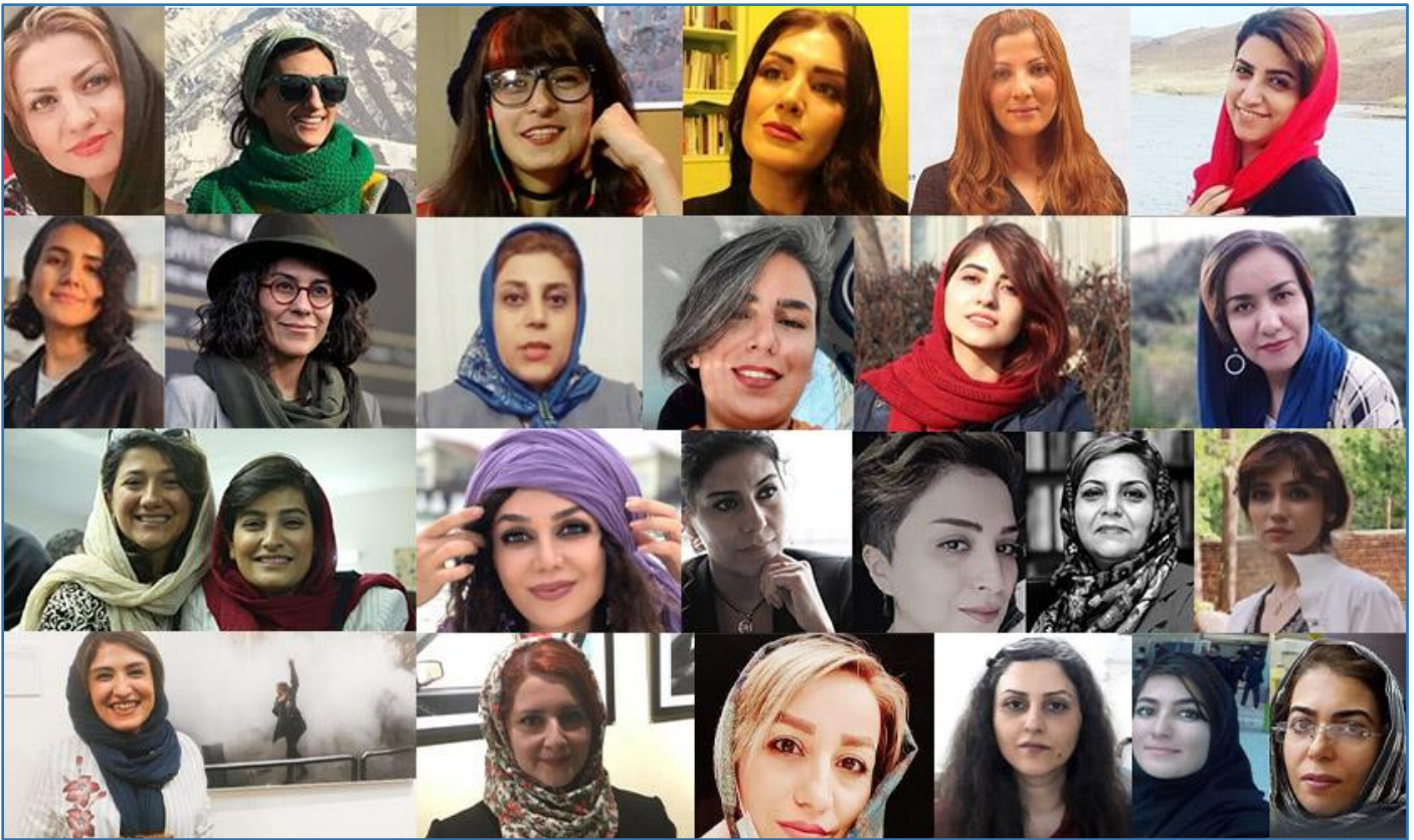
Some of the women arrested during Iran protests