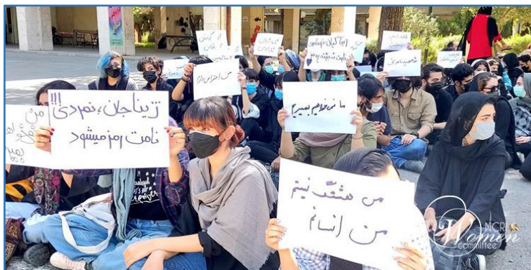
Student protest at Tehran University

"The resistant and resilient women of Iran will stand up to the tyranny and oppression of the mullahs and the IRGC and defeat them. Iranian people and women will fight back with all their might," Mrs. Rajavi reiterated.