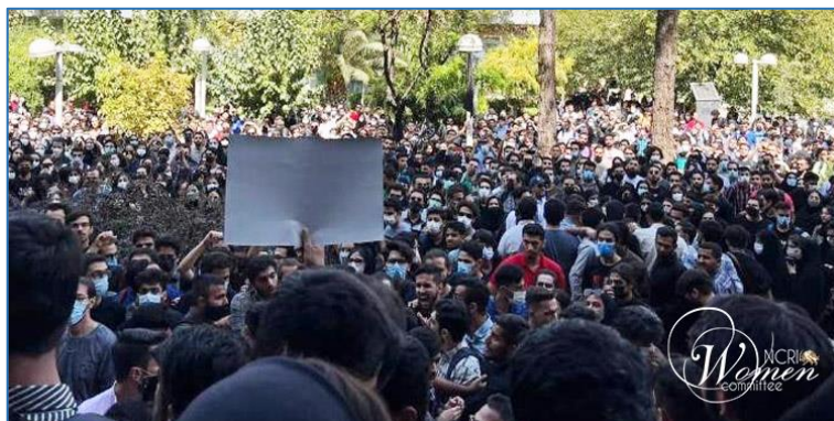
Students at Amir Kabir University