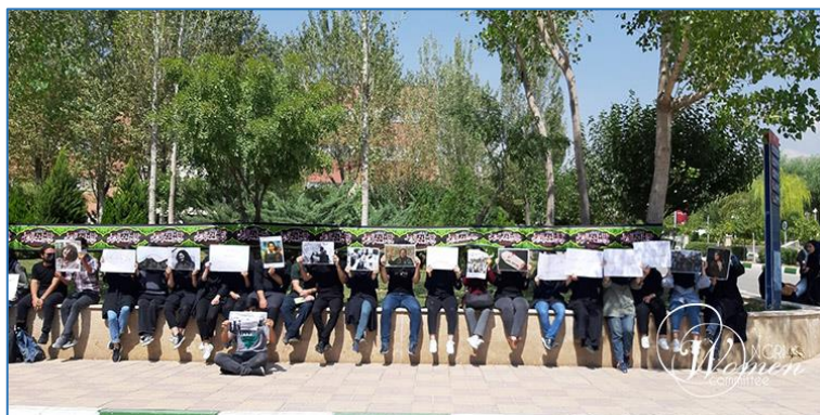
Students at Allameh University of Tehran